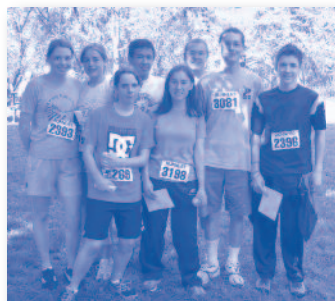
2008 team from St. Edmund Campion Academy

Individuals, families, and this year teams can participate in the Right to Life 5K